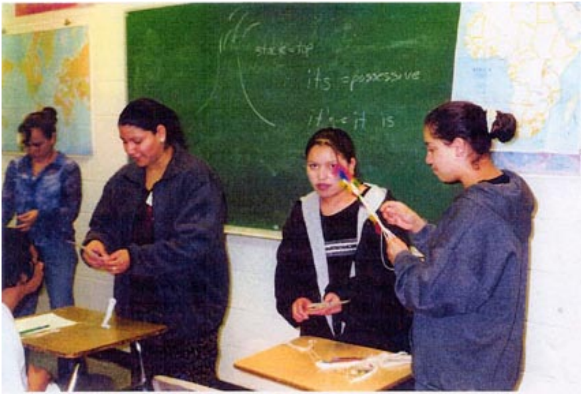
Caption to the preceding Artifact – Artifact 2 Indicator 4.11 continued